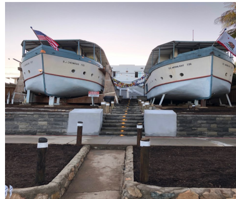
Left: Dedication day Boat-houses with the beautifully renovated landscape.