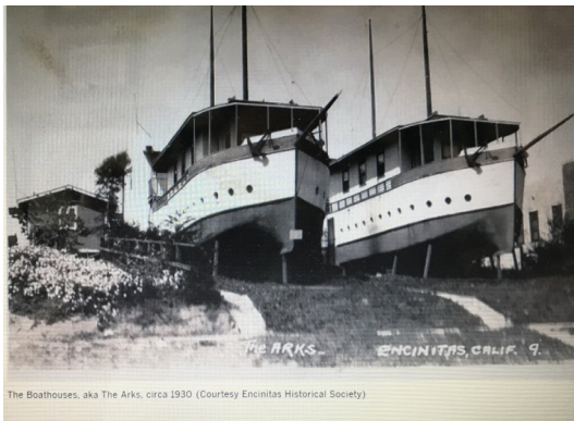
Left: The Boat-houses aka “The Arks” circa 1930.