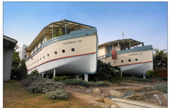
Right: EPA Purchase of the Boat-houses, May 2008